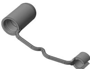
Male Plug Dust-Proof Protective Cap